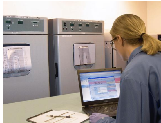
Many opportunities are available to tighten up documentation of controlled environments with modern technology.

After the excerpts, we’ll outline some best practices of a 483 response, providing you with a 10-point checklist that should make that 15-day time limit more manageable, and some links for further research. Finally, we’ll look at ways to simplify and automate monitoring, alarming and reporting on FDA regulated environments. Options range from low-tech manual methods, to hybridized systems that combine written and electronic methods of documentation, to fully automated systems.